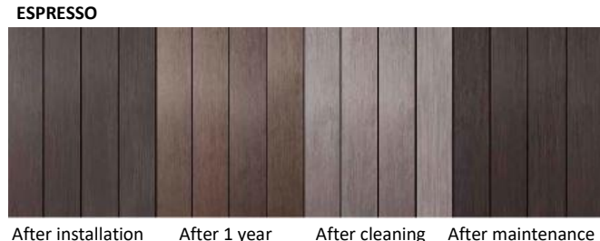
nv Pi-Import sa

Av du Commerce 33 1420 Braine-l'Alleud – Belgium Tel. : +32 (0)2 384 58 77